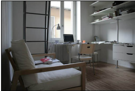
The living room