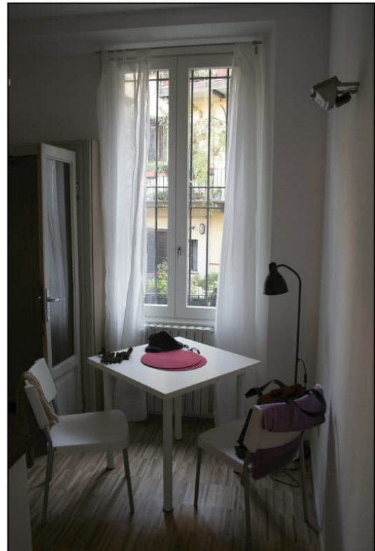
The dining area