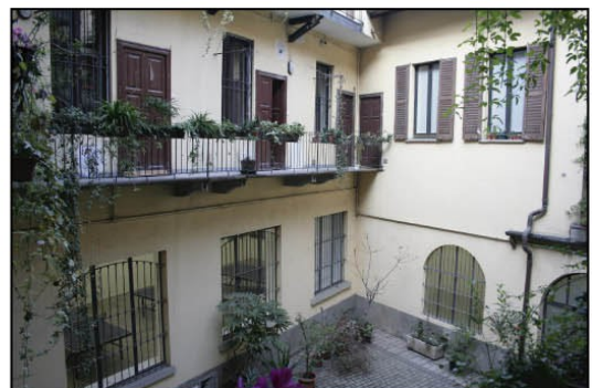
View of gallery and apartments