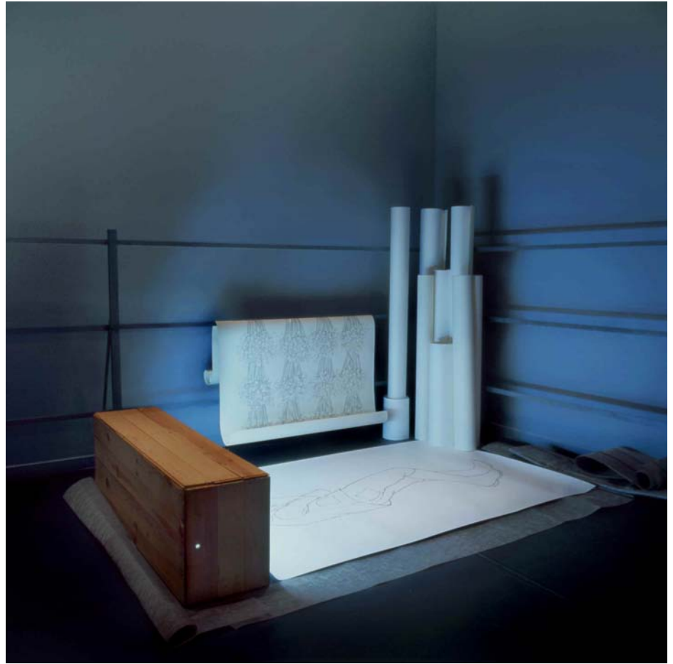
exhibition views at the Centre d'Art la Ferme du Buisson, Marne-la-Vallée, (Paris), june-july 2008