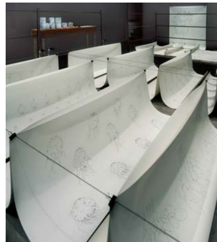
exhibition views at the Centre d'Art la Ferme du Buisson, Marne-la-Vallée, (Paris), june-july 2008