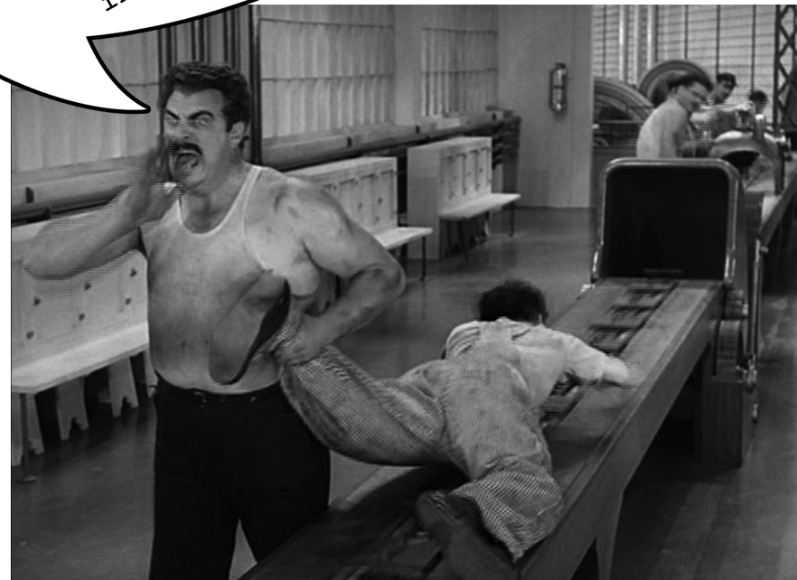
Walter Benjamin "Arcades Project" (1940) p.461

The first stage ... will be to carry over the principle of ENDOSCOPY montage into history. That is, to assemble large-scale constructions out of the smallest and most precisely cut components. Indeed, to discover in the analysis of the small individual moments the crystal of the total event.